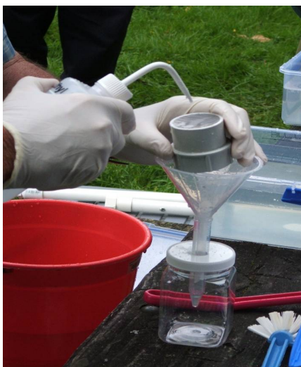
Figure 3. Wash the material from the cod end into the Falcon tube with 70% ethanol.