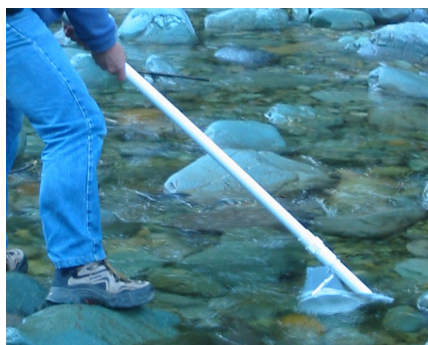
Figure 2. Deployment of the Hicks handle net for sampling algal drift.